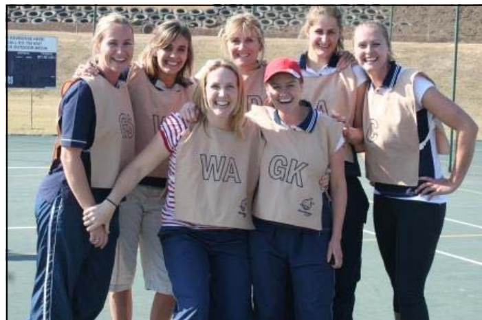
Bevy of beauties. Prep teachers netball team! Teachers won!