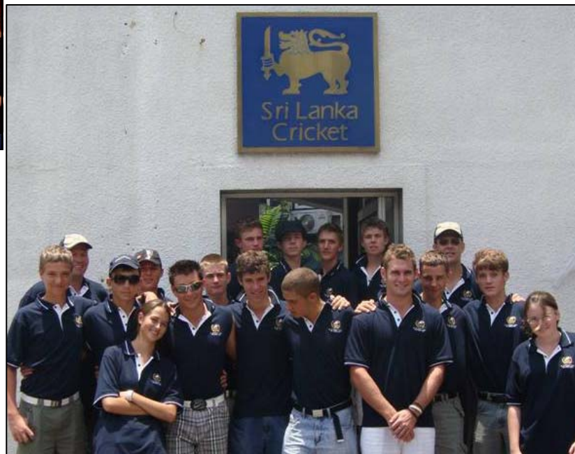
Cricket our to Sri Lanka. The team in front of Sri Sinkathan Stadium, Columbo, the headquarters of Sri Lanka Cricket.