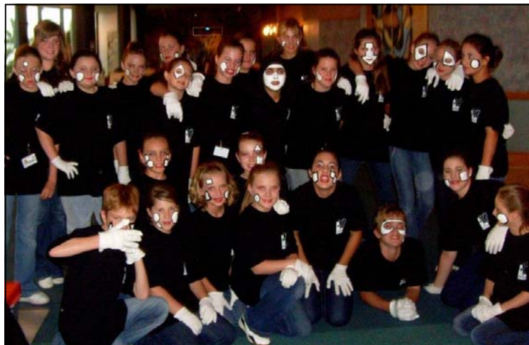
SA Champs Team - the their mime "get-up"!

Whilst most of us enjoyed a restful April school holidays, there were a few HeronBridge pupils working hard and putting our school on the map! In this edition please find articles relating to their endeavours. On this opening page we present pictures to whet your appetites. Well done to all involved.