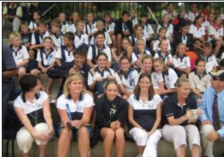
Members of the victorious team and their coaches, enjoying themselves on the day.